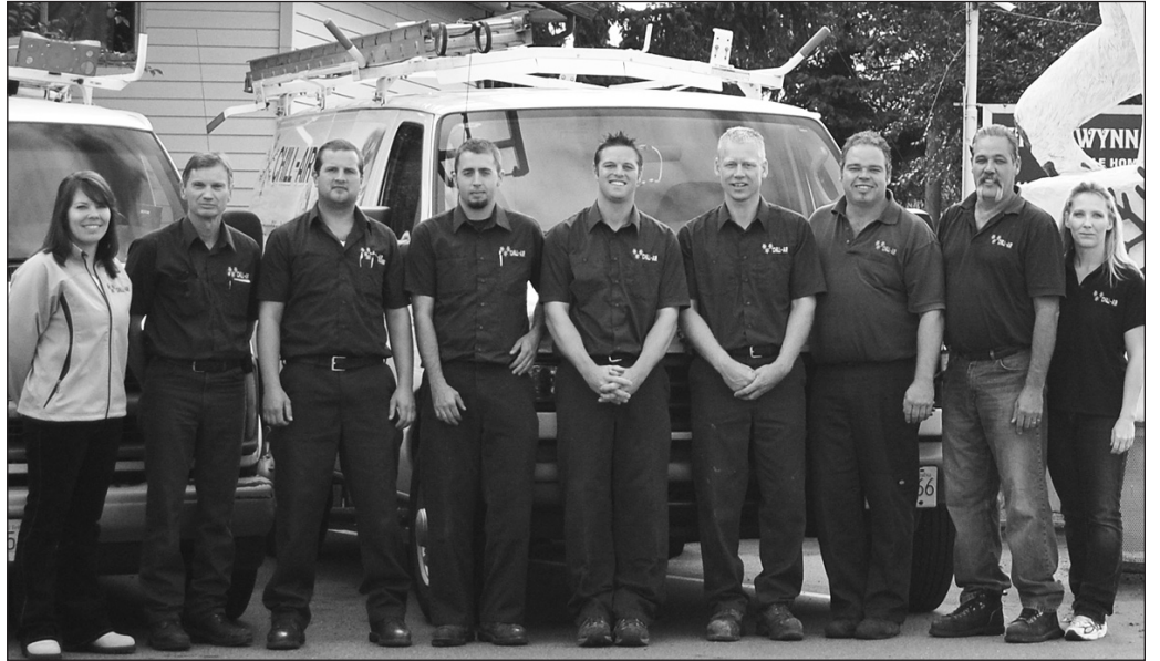
The team at Chill-Air in Chilliwack

“In many ways it has changed our lives,” she says. “My husband has always been extremely good at what he does.